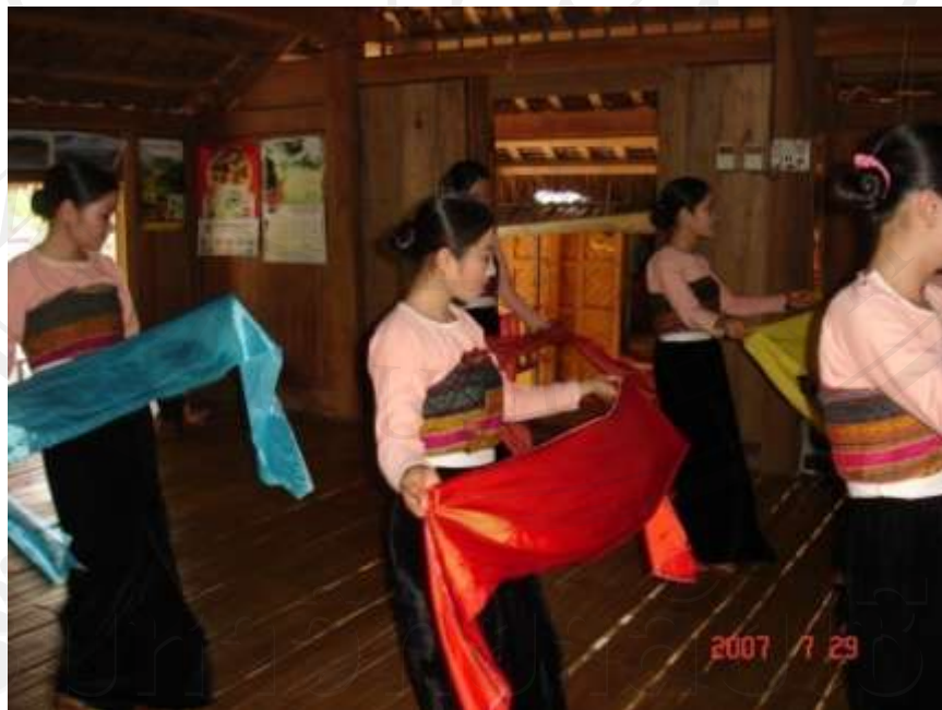
Figure 3.5. A Cultural Show at a Homestay

Apart from economic activities related to souvenir businesses, small homestay business and cultural show team, to be a better off family they have to make more variety of living. For the case of some villagers living at the periphery of the village found the difficult to benefit from opening souvenir shop and homestay business. They still can create their variety of living. And the case of Ms. Tuấn's family, she relies both on farming and tourism. In terms of farming, they cultivate wet rice, grow and sell vegetable, raise pig and so on. In dealing with tourism they rent amplifier, service, motorbike taxi and act as local tour guide, sell firewood (for camp firing) and other odds jobs, such as, local foods (such as anh lam , a glutinous rice roasted in bamboo joints), local alcohol, ice cream, and jelly.