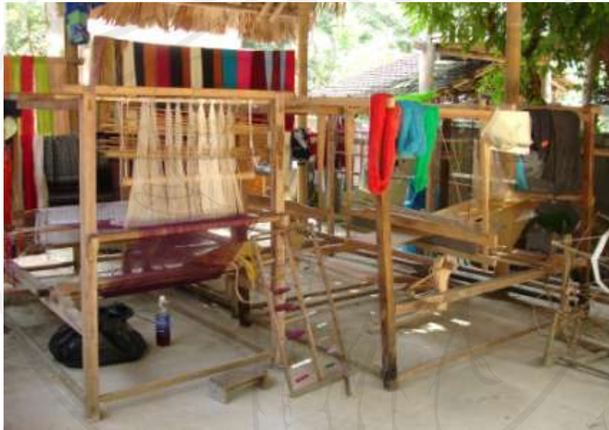
Figure 3.4. Traditional Looms

to invest for your souvenir good. If you cannot sell them, you just give them back to the producers; she has nothing to lose. Her reply is insightful: if she accepts the consignment, as long as the goods are unsold, she is still in debt to the producers. She does not like to be a debtor. She has to take care of the goods well enough to return them to the producer when unsold. She is not comfortable with that idea. Other souvenir shop owners, I talked to, has similar stories to tell.