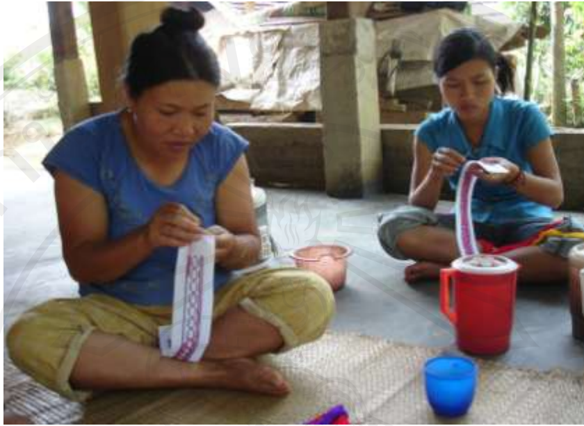
Figure 3.6. Making Embroidery at a Free Time