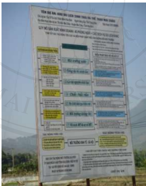
Figure 3.8 The Sign Broad of Provincial Government Promoting Environment Protection in the First Phase of Implementation of Mountainous Eco-cultural Tourism

The local authority tend to give up in business competition but the provincial government does not. Recently Thiên Minh Hòa Bình Tourism Joint-stock company in approval of Hòa Bình Provincial People's Committee by resolution No. 1091/QĐ-UBND dated May 20, 2008 has planned to build project name “Mai Châu Eco-tourism and Sport Zone” at Mai Châu Town, next to Bản Pom Coọng. What they are going to do is to build small resort which has 40 rooms plus tourist services. This resort is a method of mitigating environmental impacts. As a result, on 26 th July 2008, in order to develop the potential of “mountainous eco-cultural tourism”, 6 the Department of Culture, Sport and Tourism in Thanh Hóa and Hòa Bình Provinces, published a contract regarding sustainable corporative tourism. According to the General Directorate of Tourism, the contract contains three main points: (i) to establish connected tourist routes, (ii) to develop advertising and marketing activities, and (iii) to build those human resources working on community-based tourism.