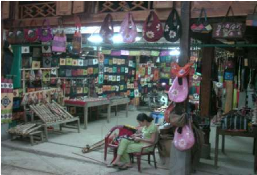
Figure 3.3. A Souvenir Shop on the First Floor of Stilt House

households turn the first floor of their stilt house into a shop. It is amazing. Almost a half of households in Bản Lác, the main tourist village and almost 20 in Bản Pom Coong are running souvenir shops. To attract the tourists, some souvenir shops put the loom in their shop and they sometimes weave traditional fabric to show the tourists much more than a mere product: the process of production. This is a kind of tactic that the villagers utilize the culture and representation of Mai Châu for survival in the souvenir market.