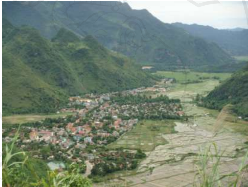
Figure 3.1 Valley of Mai Châu

Geographically speaking, Mai Châu is considered as a place of ethnic and cultural diversity and the gateway to the northwest upland region. It is located in between Hanoi and northwest region (where ethnic majority population is Tai) as well as connected by the national road no. 6, it is also a strategic place of tourist market. In addition, it is only 150 km from Na Mèo and 80 km from Mường Lát border gates with Lao P.D.R. Furthermore, due to its close proximity to Hanoi, Mai Châu has been included in the central administration instead of a part of Northwest autonomous region (see the elaboration in chapter 4).