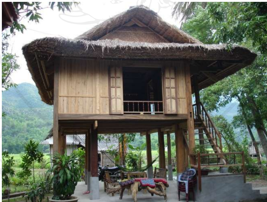
Figure 3.2. A Homestay in Mai Châu

In addition to these advantages, location of their homestays at the center of the village makes it easier to attract tourist and tour agency attention and to build socio-business networks. Besides the location, they also own valuable possession, such as, old silverwares and some amount of gold 2 . Some households have a large storage of traditional fabrics woven by them. Sale of these items and profit from selling traditional fabric/handicraft gave them enough money to gradually improve their homestay services, such as buying sleeping equipments and household appliances.