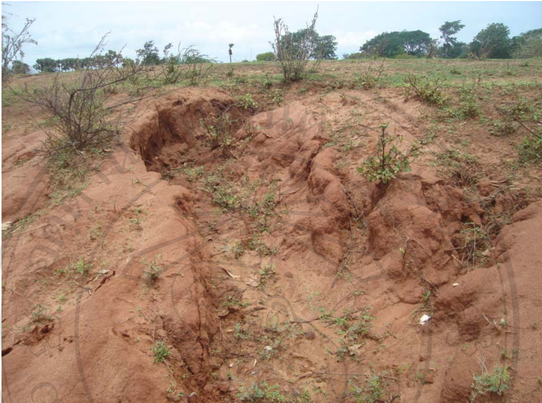
Figure 3. Gully erosion in the field of study area.