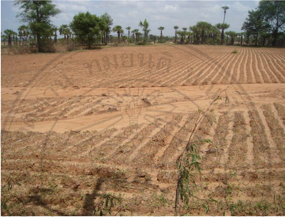
Figure 2. Rill erosion in the field of study area.