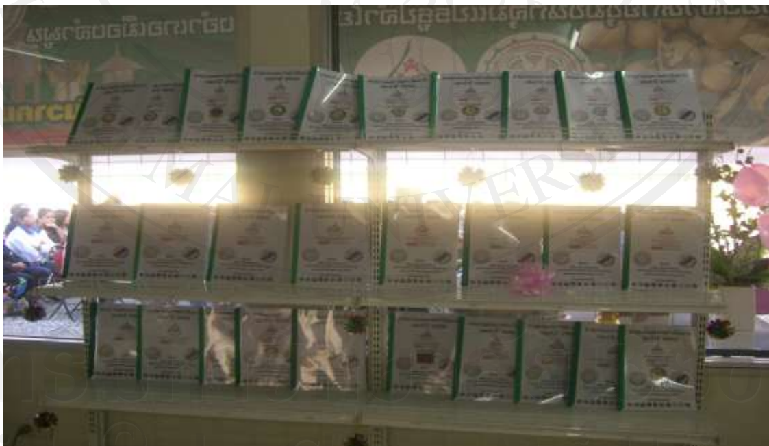
Figure 42 The information books of each small and micro community enterprise