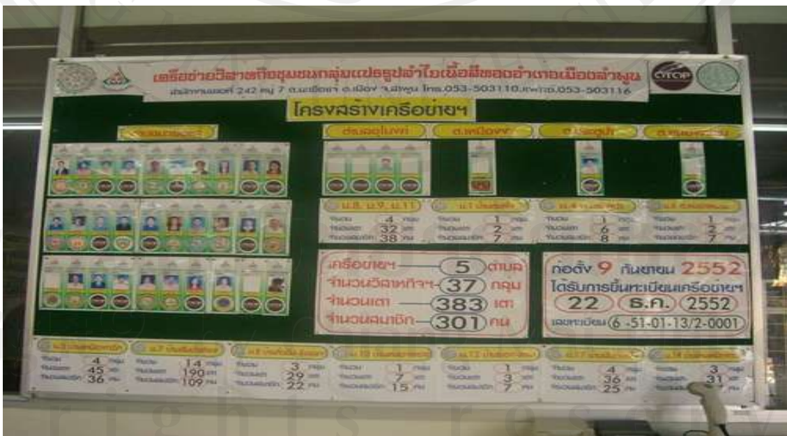
Figure 44 The Poster of DLSMCE Network in front of the DLSMCE Network Office