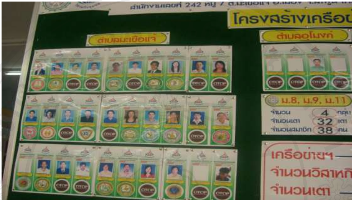
Figure 41 The organization of the board of directors and members of group