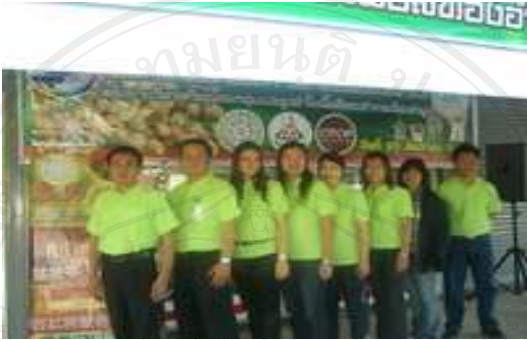
Figure 39 The boards of director of the DLSMCE Network