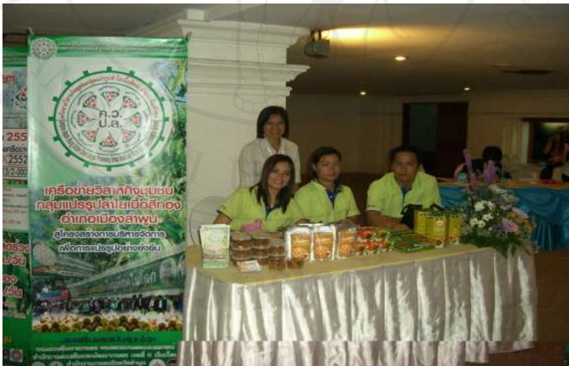
Figure 49 The roadshow and exhibition of the DLSMCE network