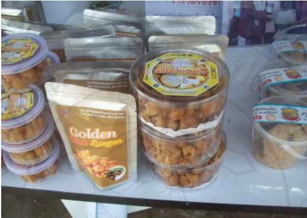
Figure 53 The product quality of dried longan of the member DLSMCE network