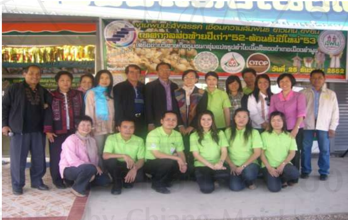
Figure 40 The boards and advisor of director of the DLSMCE network