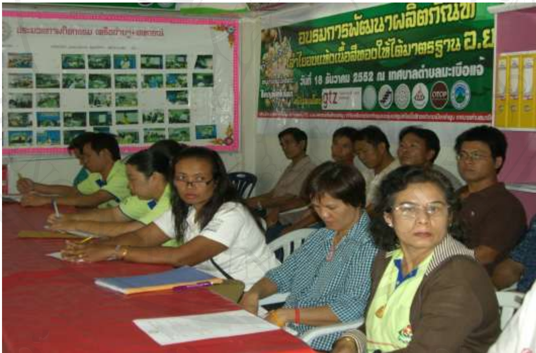
Figure 50 The training of golden dried longan quality development to FDA standards of the members of the DLSMCE network

6.2.2 Improvement of product quality and production houses during the research, committee and member of the network is planned to run continuously. According to the research process, the core research team as a facilitator and officer supervising the operations of the enterprise community had to coordinate the relevant agencies to promote and support, such as (GTZ) provided training and practical training of golden dried longan quality development to FDA standards, the development of house production to GMP standards and the packaging development to meet the market needed. It had been good cooperation with the Lamphun provincial agricultural extension office, Lamphun provincial public health office, Lamphun industrial office etc. (Figure 50, 51, 52, 53)