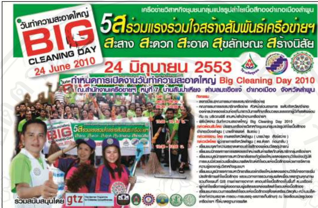
Figure 54 The Big Cleaning Day event of DLSMCE network