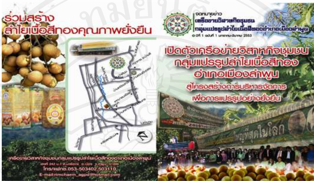
Figure 45 The newsletter of DLSMCE network in Lamphun province