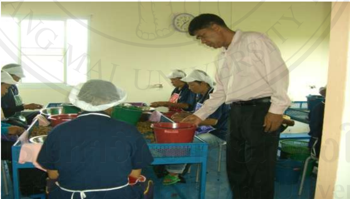
Figure 52 The head of Lamphun provincial agricultural extension office visited the members of DLSMCE network