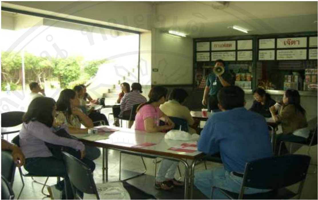
Figure 48 The study tour at Bang Sai Arts and Crafts Center Ayutthaya