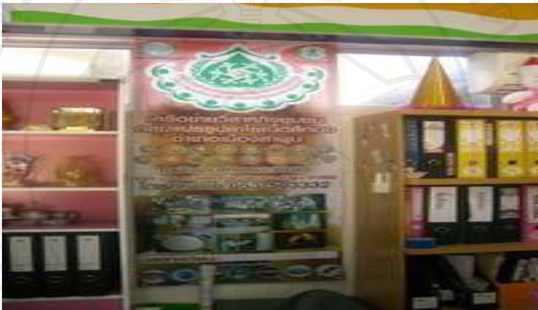
Figure 43 The office of the DLSMCE Network

6.1.3.2) Apply the lesson on utilization of data and information within their own DLSMCE group. From participating in the activities, the network members have to share their learning and work activities and task at a time. So, the sub-group of community enterprise must have meetings, both formal and casual to plan to work together, learn from the learning stage of the activities to develop and improve operations in their sub-group.