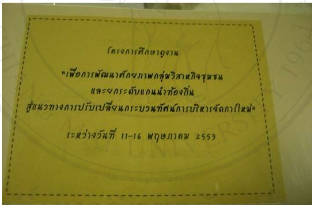
Figure 47 Fieldtrip on enhance local leaders to approach a new management paradigm shift

6.2.1 Cooperation with and support from associated organizations and partnerships. During and after the research, a community enterprise network gain the attention and support from relevant agencies such as Chiang Mai University, the boards and its members have joined workshops, seminars, observation and the program of community capacity-building enterprises along the sufficiency economy philosophy in the northern hemisphere on March 31, 2010 at the Mercure Hotel Chiang Mai to observe the course of potential developing community enterprise and enhance local leaders to approach a new management paradigm shift on May 11-16, 2010 at Ayutthaya, Chachoengsao, Rayong Trat and Chanthaburi as Figure 47, 48, 49