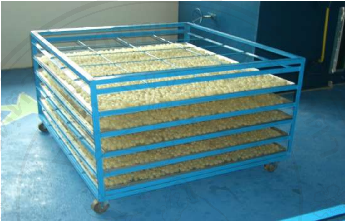
Figure 51 The practical training of golden dried longan quality development to FDA standards of the members of DLSMCE network