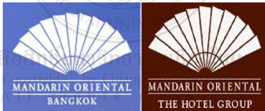
Figure 17 The Mandarin Oriental, Bangkok and Mandarin Oriental Hotel Group registered logos

When Mandarin Oriental Hotel Group publicly launched the company on the Hong Kong Stock Exchange in the mid-1980's, there was a desire to create a symbol that embodied the hotel group's luxurious and elegant image, yet was still reflective of each hotel's local charm. The company name evolved from the bringing together of the Group's original flagships, The Mandarin in Hong Kong and The Oriental in Bangkok, two award-winning properties that were considered synonymous with quality. It was felt that it would be a profoundly meaningful symbol of oriental culture and would strike a delicate balance—one that had a certain Oriental essence without being overly ethnic. After a great deal of consultation with an internationally recognized design house, and research into symbols that embodied luxury, elegance and comfort, the Fan logo was born. Classically simple, visually elegant and indisputably a part of the Orient, the eleven-bladed fan ties together each hotel into the single identity of their luxury hotel group. The logo is a registered trademark internationally, and is regarded within the tourism industry as one of the world's most highly recognized logos.