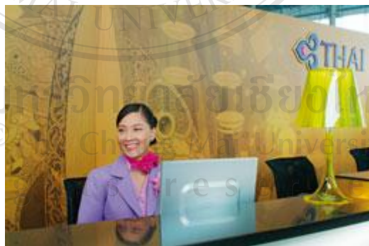
Figure 19 THAI logo with the "curve graphic"

Elements of THAI's Brand. THAI's registered brand consists of a number of inter-related elements which, together, make up its visual identity and project their desired corporate image at all points of contact with customers. The basic elements include a 'brand signature', consisting of the colorful symbol and associated logotype. THAI's long established and widely recognized tagline "smooth as silk" is often used in conjunction with the brand signature to highlight their philosophy of service. The connection between THAI and Thai silk has been close since the airline was founded, for instance, in the use of lustrous Thai silk for the cabin attendants' in-flight uniforms. Another linking element, seen in THAI's advertising and printed material, is the specially designed 'curve graphic', which is symbolic of the traditional 'Thai Wai' gesture of greeting.