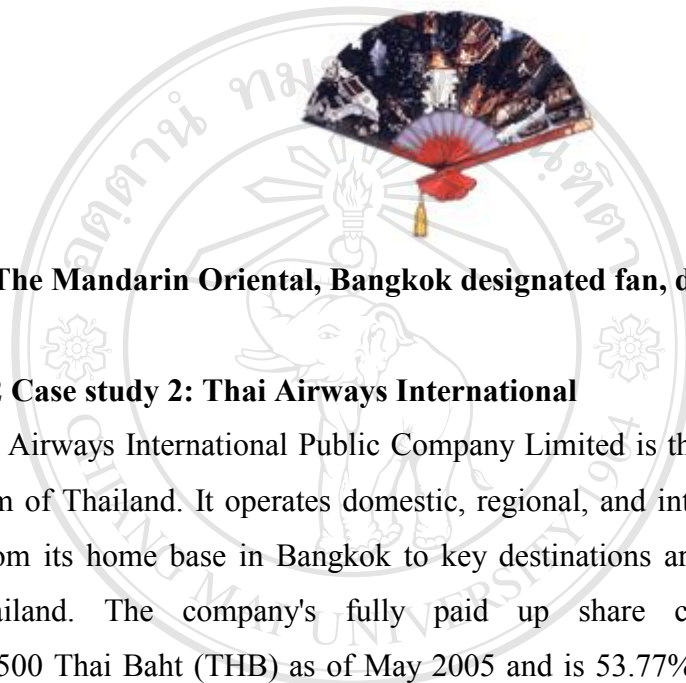
Figure 18 The Mandarin Oriental, Bangkok designated fan, dating back to 1810

Colors, designs and prints are carefully chosen in collaboration with local artists, historians and graphics experts. Originality also plays a key role in determining the desired fan for each hotel. The designated fan for Mandarin Oriental, Bangkok is an antique Ramayana fan depicting life by the river and dates back to 1810. It aptly connects the hotel to its historical roots as well as its prime location on the banks of the Chao Phraya River.