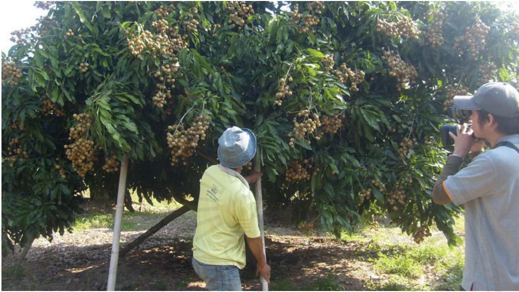
Figure 2.1 Longan tree at the orchard.