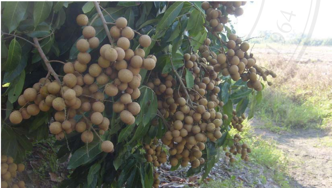
Figure 2.2 Fresh longan fruits.

The produce of fresh longan is about 500,000 tons per year covering about 2-month period. Not all of them can be sold as fresh longan. Fresh longan of about 300,000 tons must be dried to extend the shelf life. At present, there is no specific moisture tester for dried longan aril.